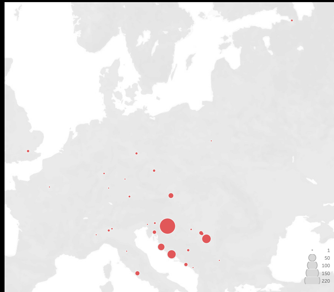
Map 1. Spatial distribution of articles on Ivan Meštrović published in 1910 and 1911 (data processed using Tableau software)