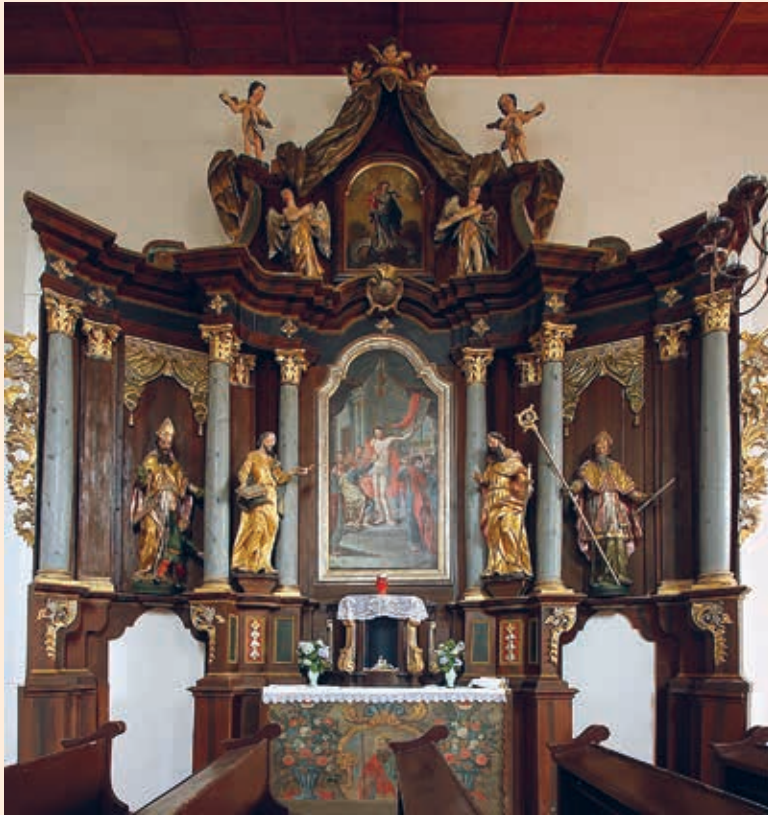
Tomaš, kapela sv. Tome, glavni oltar, sredina 18. stoljeća