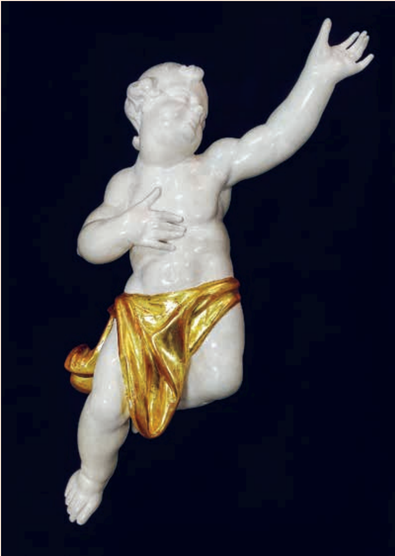
Anđeo s oltara crkve svetih Petra i Pavla u Osijeku, oko 1766., Osijek, Muzej Slavonije