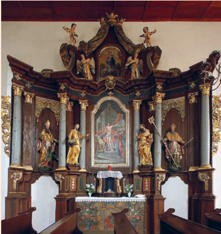
Tomaš, kapela sv. Tome, glavni oltar, sredina 18. stoljeća

samostalni istraživač, Križevci Independent researcher, Križevci zdenkobalog3@gmail.com