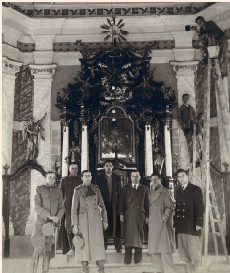
Glavni oltar u kapeli sv. Ane, 1930-ih, Slavonski Brod; izvor: Muzej Brodskog Posavlja