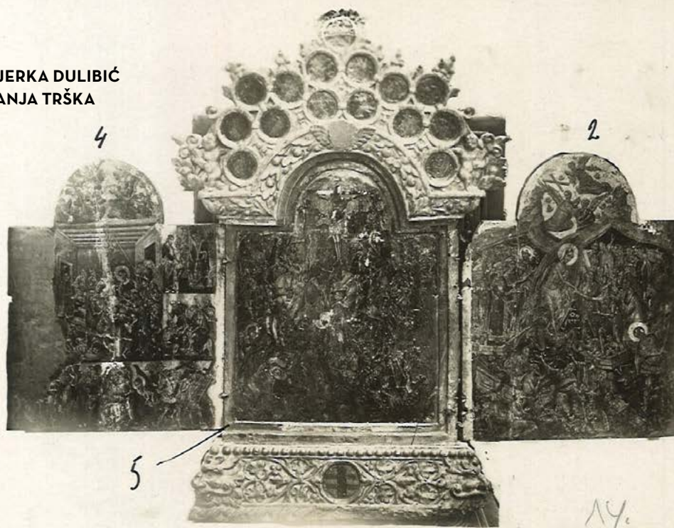
LJERKA DULIBIĆ TANJA TRŠKA