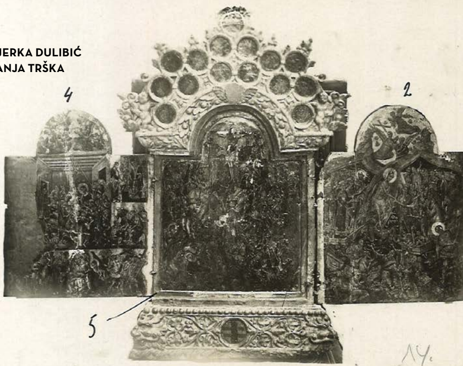
LJERKA DULIBIĆ TANJA TRŠKA