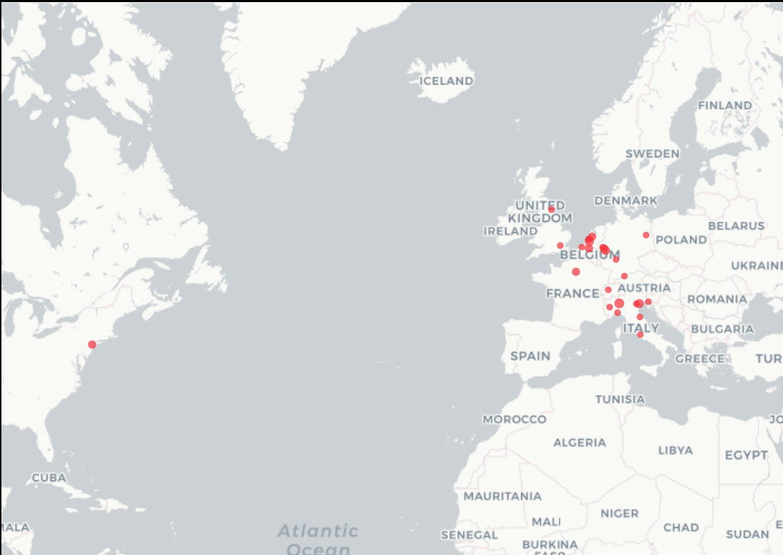
Map 2. Spatial distribution of exhibitions related to New Tendencies in 1962-1963

ist” layer of the movement. Result of such strategy was a rather interesting, and quite important proposition of the new poetic configuration of the European art scene that doubtlessly influenced the next, XXXII Venice Biennale. The importance of the 1963 international Biennale di San Marino is also confirmed by the calculations of centrality measures, according to which it was most important of twenty-seven exhibitions related to New Tendencies, and encompassed by this visualisation (Table 4-6).