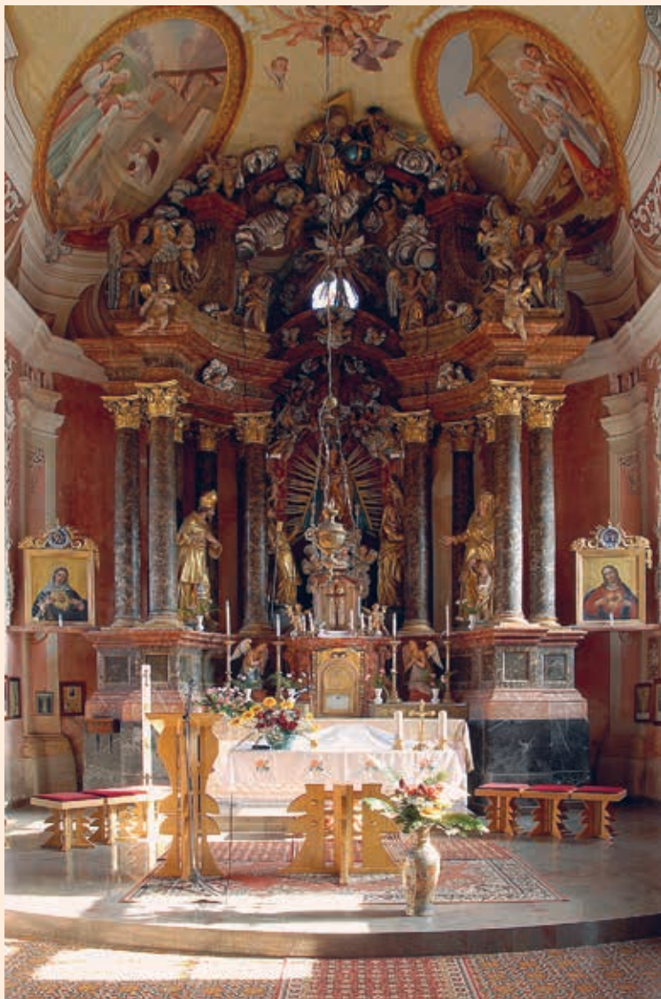
Zagorje pri Pilštajnu, crkva sv. Marije, glavni oltar, oko 1711. – 1714.