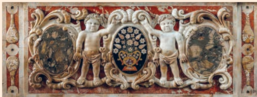
Zagreb, katedrala, reljef na stipesu oltara Posljednje večere, 1703.; snimio: Paolo Mofardin