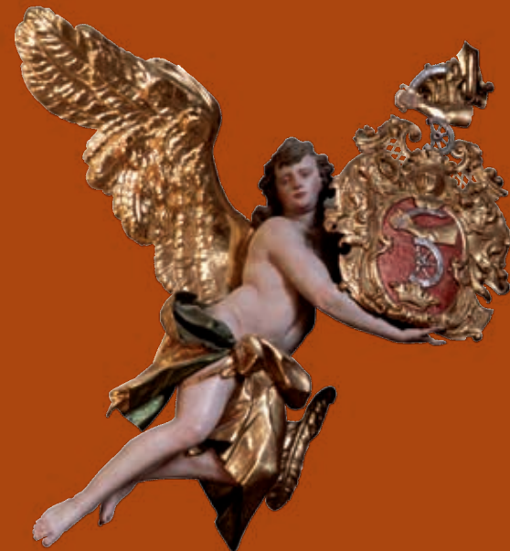
Unknown sculptor, Angel with Bedeković Komorski family coat of arms, high altar, church of Our Lady of Snow, Belec, 1743