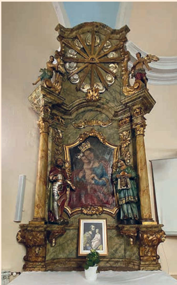
Cerje (Sesvetski Kraljevec), crkva sv. Ivana apostola i evanđelista, oltar Blažene Djevice Marije, 1771.