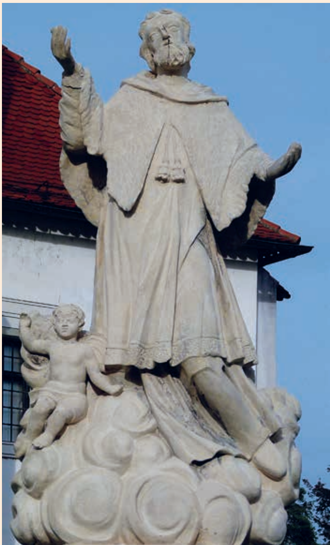
Sv. Ivan Nepomuk, oko 1766., Varaždin, Stari grad