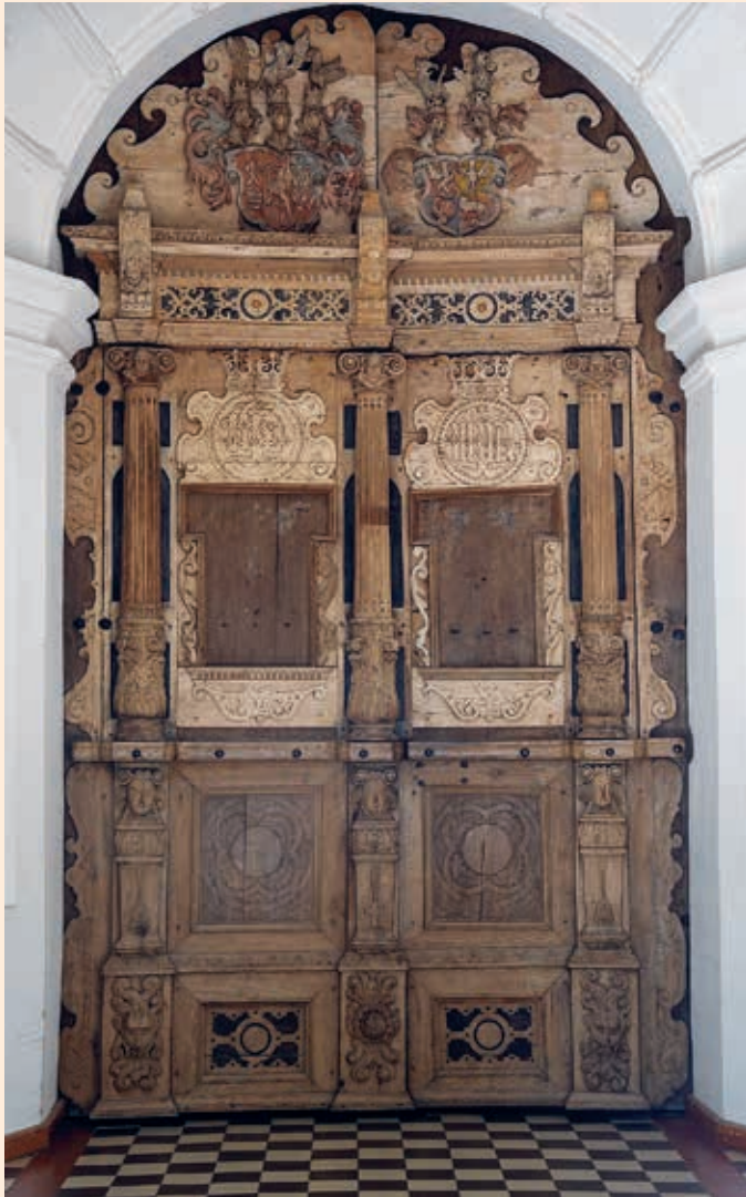
Kretinga, crkva Navještenja Blažene Djevice Marije, vratnice glavnog portala, oko 1619.