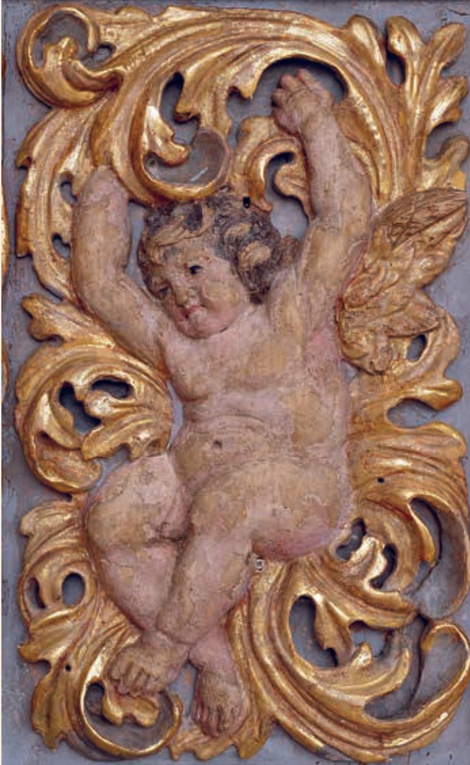
Gotalovec, kapela sv. Petra, oltar sv. Marije Magdalene – detalj, 1680-te