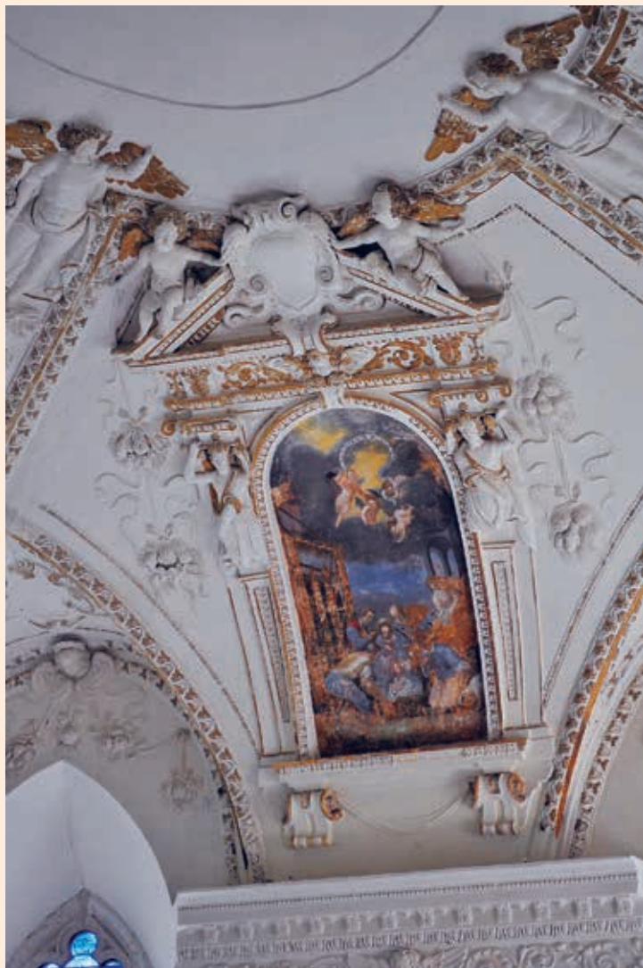
Sopronkeresztúr (Deutschkreuz), kapela dvorca Nádasdy, štuko-dekoracije, 1640-te; snimio: Ferenc Veress