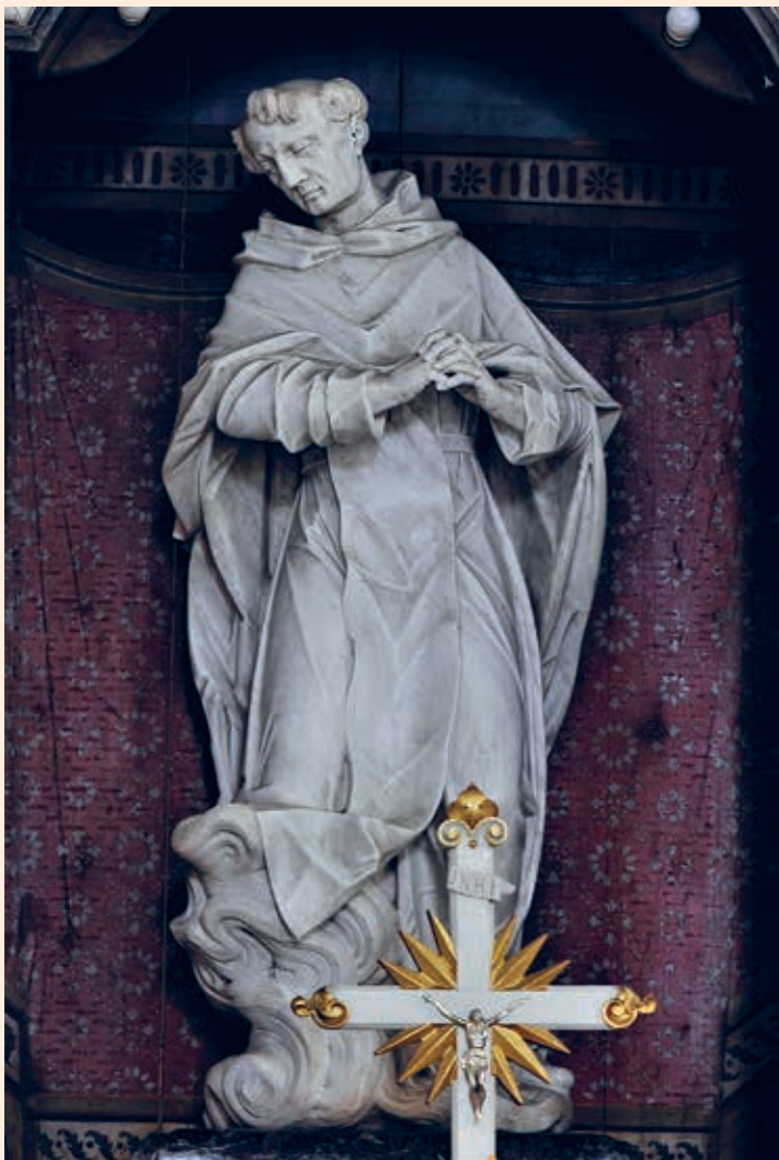
Bl. Augustin Kažotić s nekadašnjeg oltara sv. Jurja u zagrebačkoj katedrali, 1746. –1749. Lupoglav, crkva bl. Augustina Kažotića