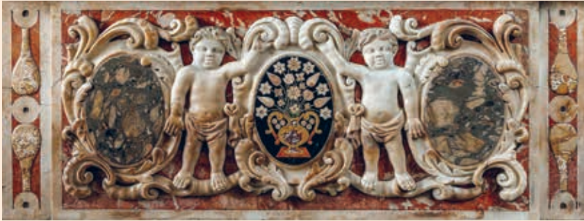
Zagreb, katedrala, reljef na stipesu oltara Posljednje večere, 1703.