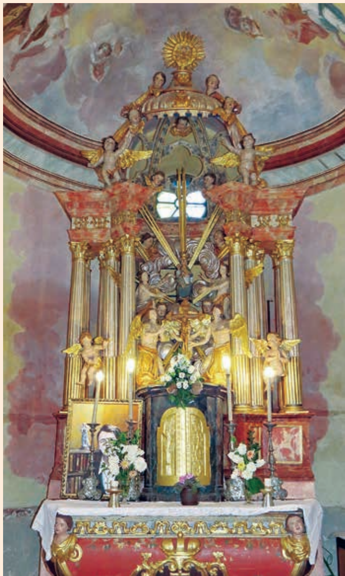
Donja Voća, crkva sv. Martina, oltar Blažene Djevice Marije, 1741.