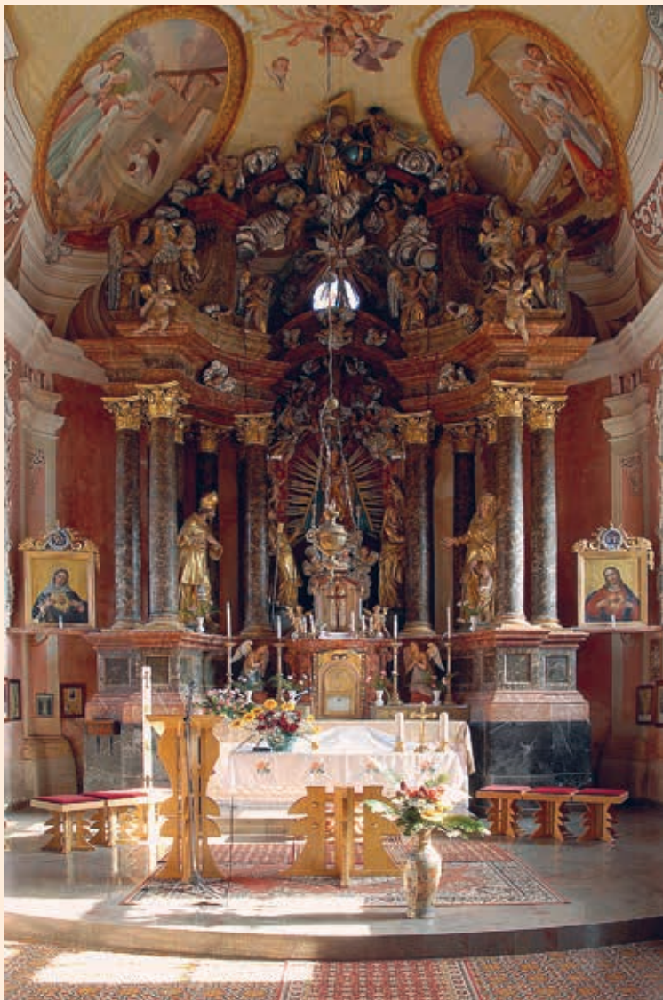
Zagorje pri Pilštajnu, crkva sv. Marije, glavni oltar, oko 1711. – 1714.