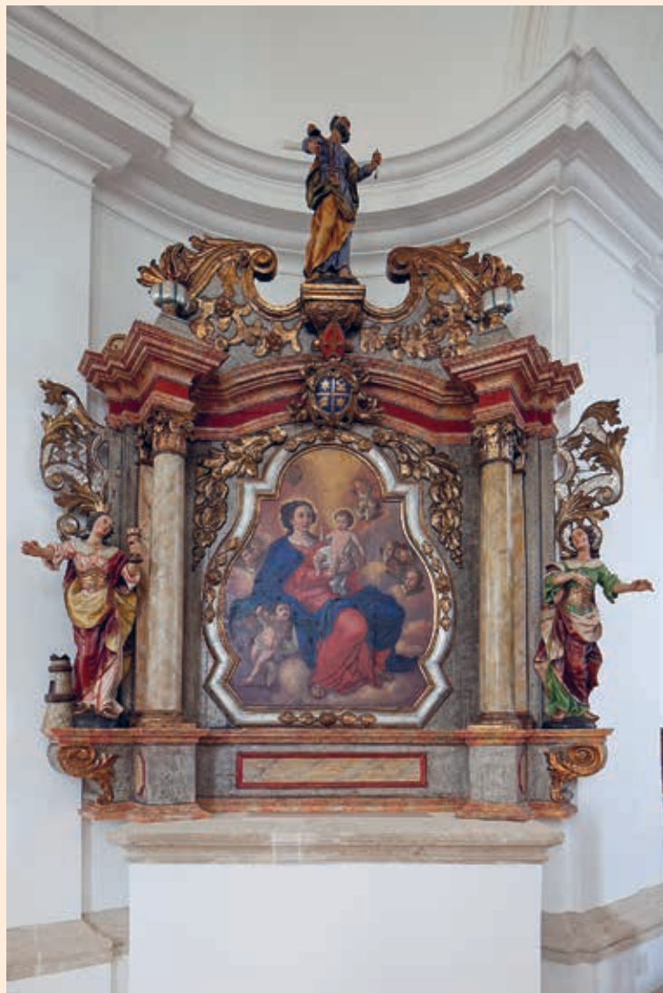
Pokupsko, crkva Uznesenja Blažene Djevice Marije, oltar Blažene Djevice Marije, 1739.; snimio: Filip Beusan