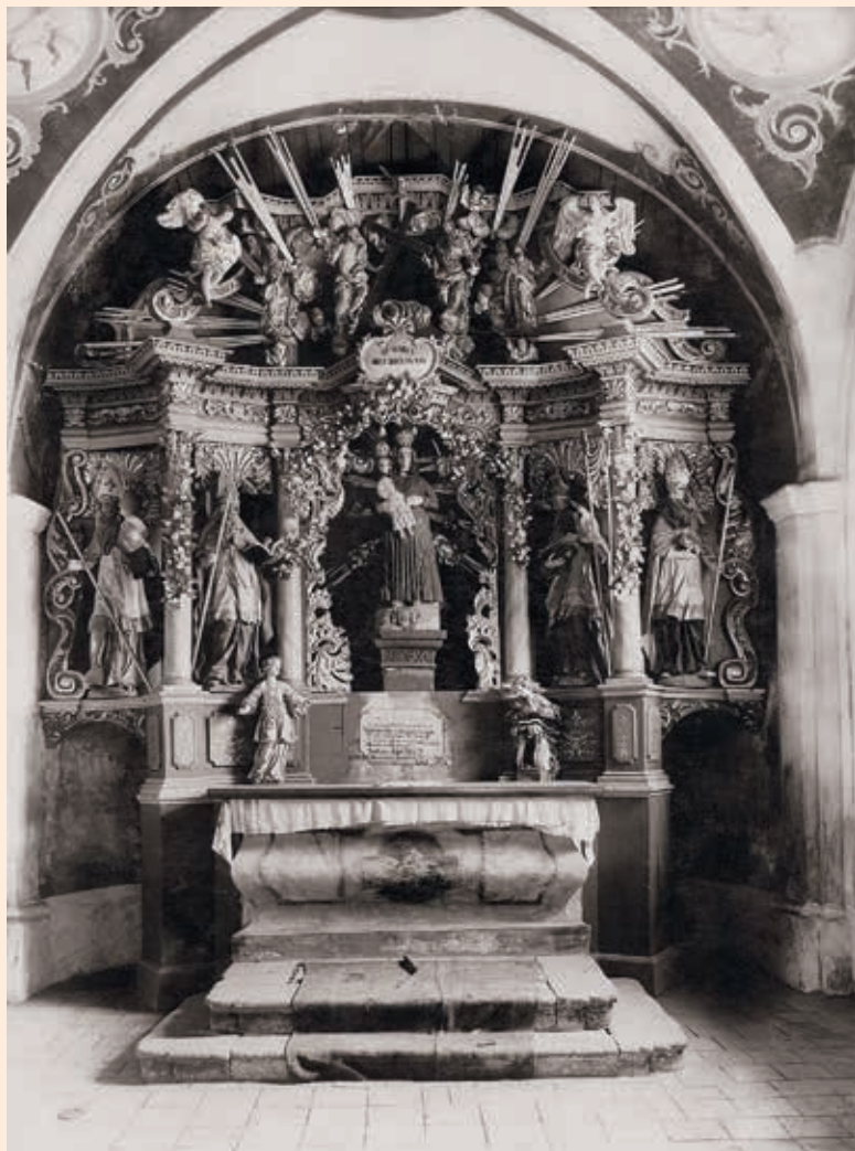
Stupnik, kapela Blažene Djevice Marije Lauretanske, glavni oltar, 1749.