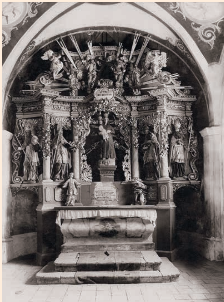
Stupnik, kapela Blažene Djevice Marije Lauretanske, glavni oltar, 1749.