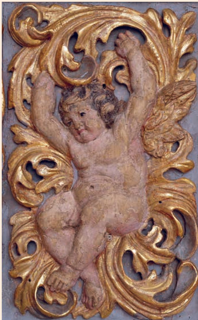
Gotalovec, kapela sv. Petra, oltar sv. Marije Magdalene – detalj, 1680-te