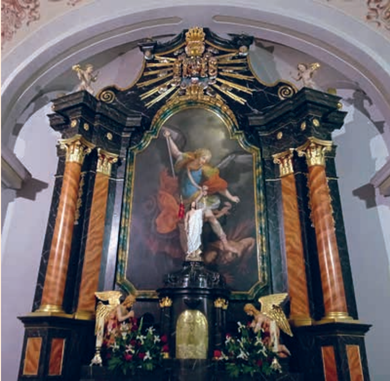
Donji Miholjac, crkva sv. Mihaela, glavni oltar, 1738.

Na području slavonskih gradova Donjeg Miholjca i Valpova nalaze se crkve sličnog arhitektonskog tipa te uređenja interijera. Crkva sv. Mihaela u Donjem Miholjcu današnji izgled duguje restauraciji na poticaj obitelji Prandau početkom 18. stoljeća te je tada poprimila barokne odlike, a barokna obilježja naglašeno srednjoeuropske derivacije otkriva i valpovačka župna crkva. U interijerima obiju crkava nalaze se slike iz razdoblja kasnog baroka, ili pak slikane prema baroknim predlošcima, barokne skulpture, orgulje te ostala oprema iz tog razdoblja. Vizualno dominantna mjesta u crkvama zauzimaju glavni oltari s palama koje su slikali umjetnici srednjoeuropskog podrijetla, nadahnuti talijanskim uzorima. U radu će se sagledati odnos spomenutih pala i njihovih talijanskih modela, kao i razlog njihova izbora, kontekst nastanka slika te, u slučaju donjomiholjačke crkve, odnos slike s pripadnom skulpturom. Nadalje, osvrnut ću se na dosad slabo istraženu opremu i skulpturalnu dekoraciju obiju crkava. U donjomiholjačkoj crkvi to su orgulje te nekoliko skulptura svetaca, a u valpovačkoj zanimljivi bočni oltari i barokna propovjedaonica. Istražit će se i mogući utjecaji te kontekst nastanka tih djela.