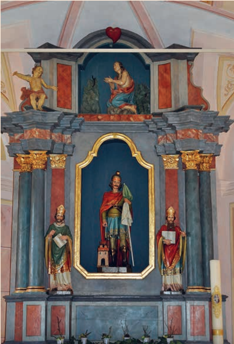
Klanjec, kapela sv. Florijana, glavni oltar, 1761.

Uspoređujući njezine opise s novosnimljenim fotografijama crkvenih interijera i pojedinačnih oltara, zaključeno je da se unutar dvadesetak godina dogodila opsežna devastacija sakralnog inventara, o čemu smo u suautorstvu priredile izlaganje na 1. kongresu hrvatskih povjesničara umjetnosti , održanu 2002. godine, koje je objavljeno 2004. u zborniku kongresa pod naslovom Recentna devastacija baroknog sakralnog inventara na području Hrvatskog zagorja . Publikacija Umjetnička topografija Krapinsko-zagorske županije objavljena je 2008. godine i u njoj su dostupni podaci o stanju na terenu početkom 2000-ih.