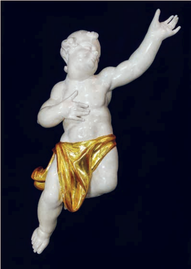
Andeo s oltara crkve svetih Petra i Pavla u Osijeku, oko 1766., Osijek, Muzej Slavonije