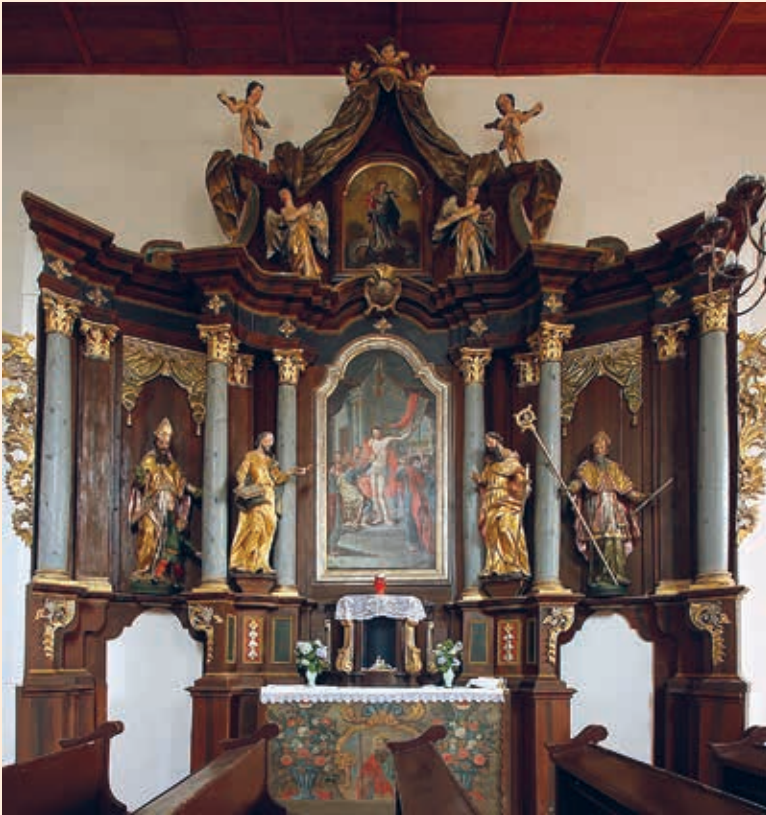
Tomaš, kapela sv. Tome, glavni oltar, sredina 18. stoljeća