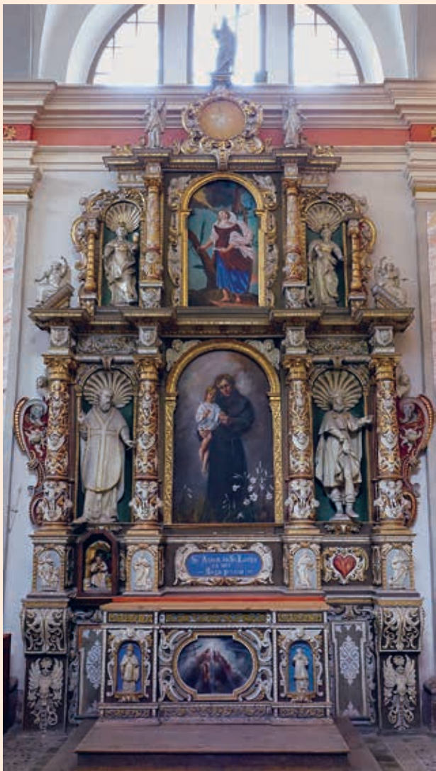
Vrhnika, crkva Presvetog Trojstva, oltar sv. Antuna Padovanskoga, 1654. -1659.