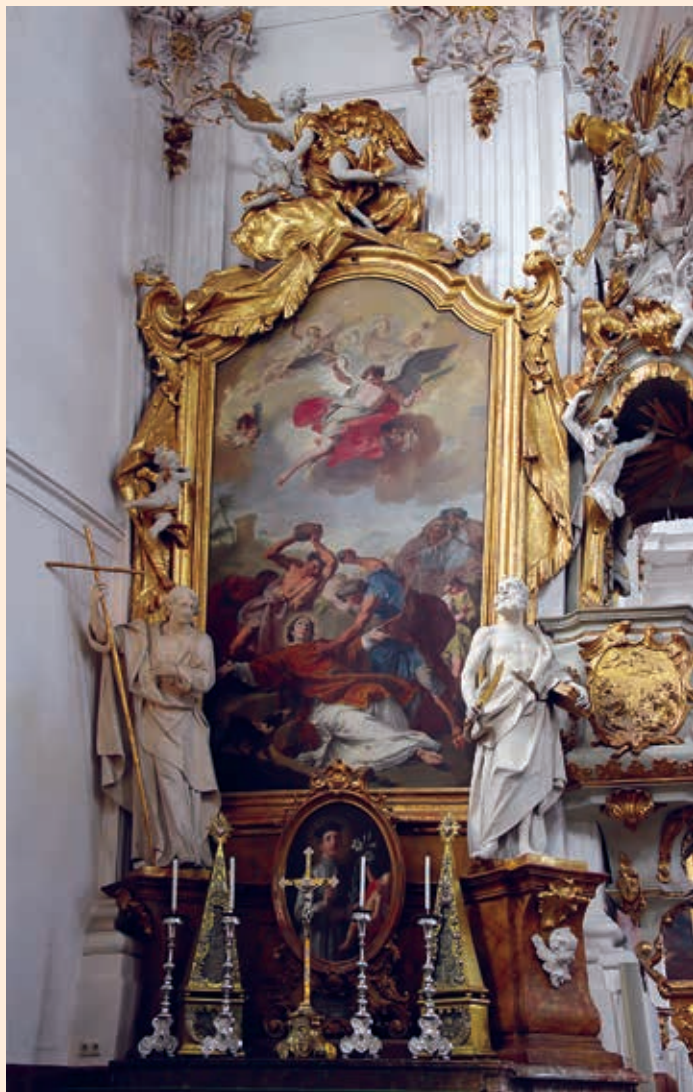
Dießen am Ammersee, crkva Uznesenja Blažene Djevice Marije, oltar sv. Stjepana, 1738. – 1740.