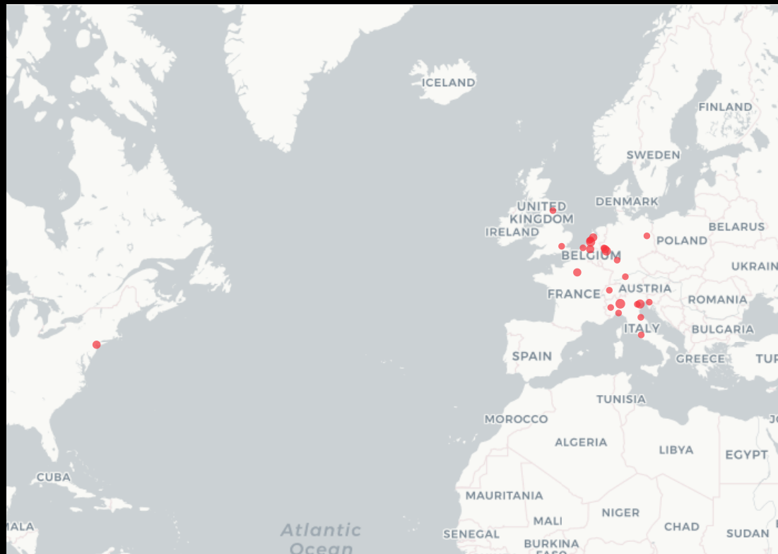
Map 2. Spatial distribution of exhibitions related to New Tendencies in 1962-1963

ist” layer of the movement. Result of such strategy was a rather interesting, and quite important proposition of the new poetic configuration of the European art scene that doubtlessly influenced the next, XXXII Venice Biennale. The importance of the 1963 international Biennale di San Marino is also confirmed by the calculations of centrality measures, according to which it was most important of twenty-seven exhibitions related to New Tendencies, and encompassed by this visualisation (Table 4-6).